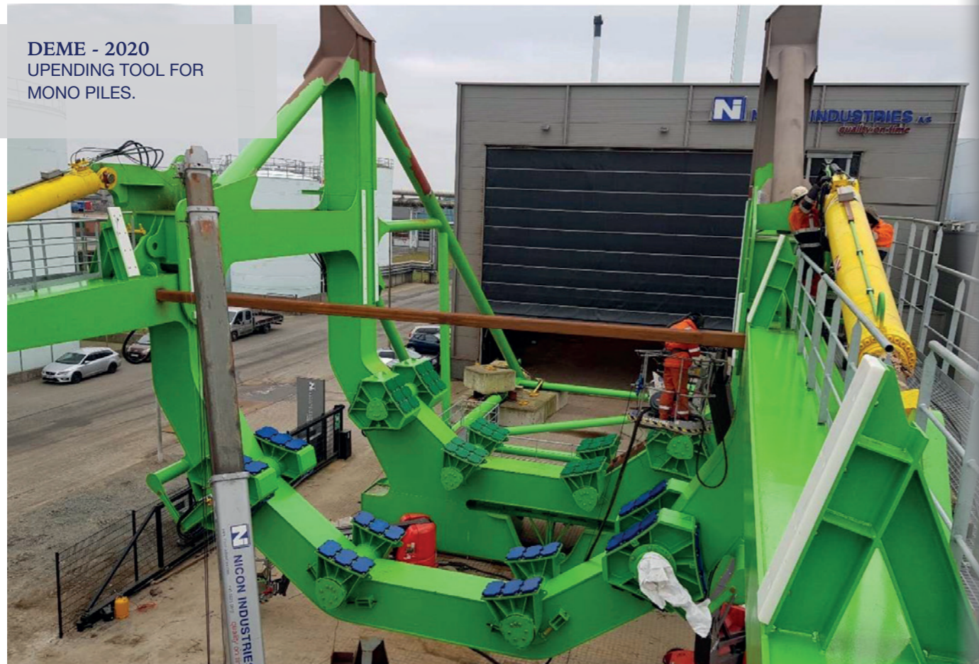
DEME - 2020 UPENDING TOOL FOR MONO PILES.