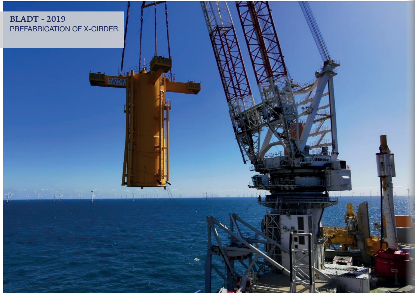
BLADT - 2019 PREFABRICATION OF X-GIRDER.