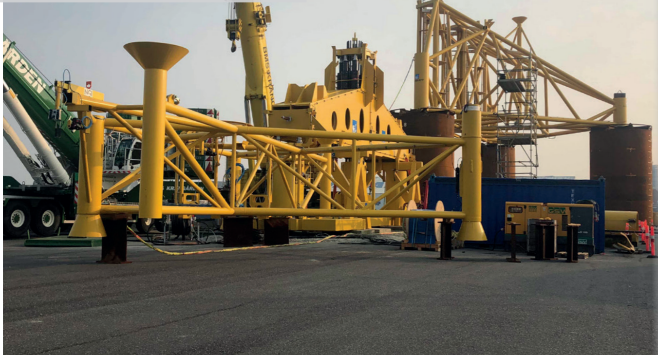
AARSLEFF - 2018 PREFABRICATION OF TEST EQUIPMENT FOR THE GREATER CHANGHUA OFFSHORE WIND FARM IN TAIWAN.